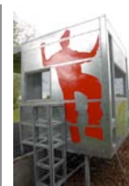
Warndon completed Worcester 2 SP.jpg