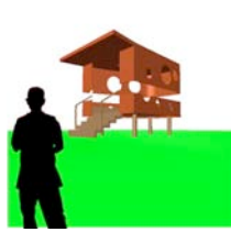
Romsley design image Romsley 1 MK.jpg