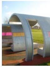
Coleshill Shelter completed Coleshill 1 MK.jpg

Two images from each of the six pilot projects