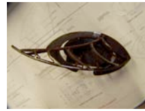
Hunderton model Hereford 1 VB.jpg