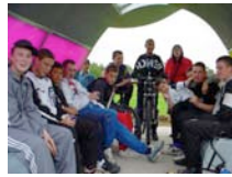
Coleshill Shelter in use Coleshill 2 SG.jpg