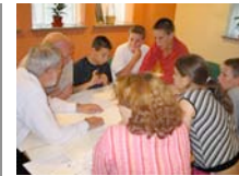
Hunderton design meeting Hereford 2 CS.jpg