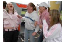
Warndon in use Worcester 1 CS.jpg