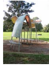
Stechford completed Stechford 1 PG.jpg