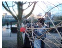
Penn Island design exercise Wolves 2 SdaC.jpg Copyright Sjolander da Cruz Architect