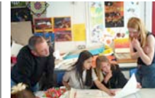
Stechford design workshop Stechford 2 CM.jpg