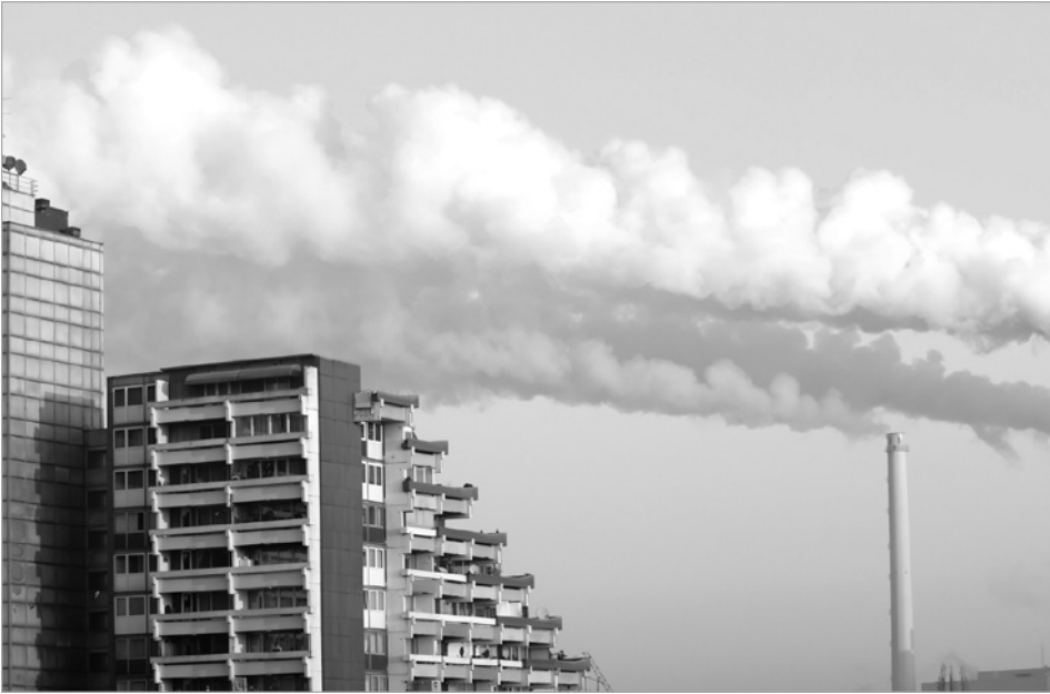
Photograph: Capacity Global's environmental justice projects.

deprivation. For example, studies have shown that noise levels can negatively affect the educational performance of children, impacting in particular on pupils with English as a second language. There is also evidence that noise leads to impaired reading comprehension and recognition memory in children, as well as to reduced motivation and poor long-term memory.